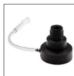
A00000135 Sensor check