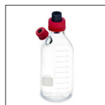
A00000410 Denitrification glass bottle