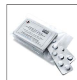
A00000136 Control Test tablets